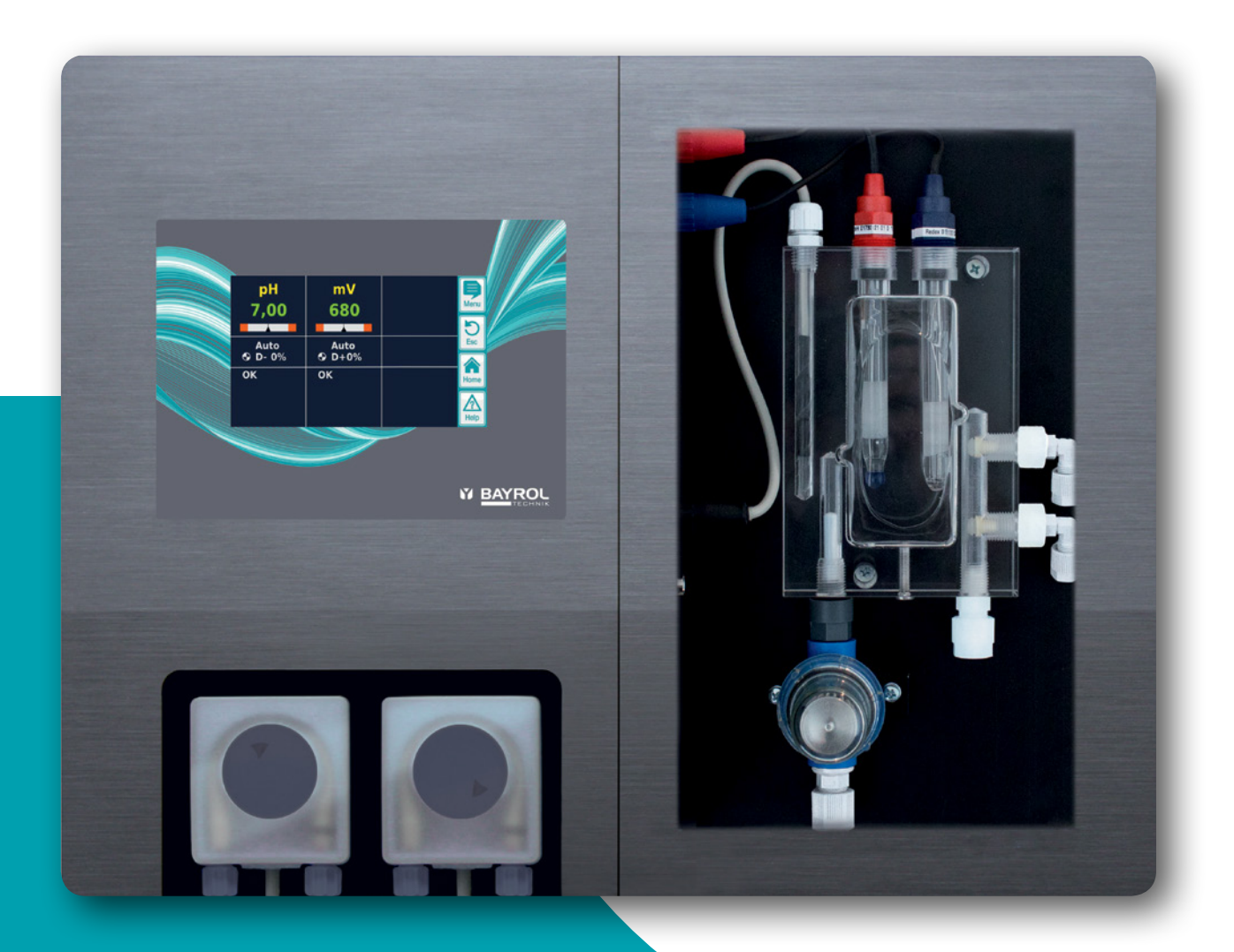
Sectional view shows Pool Relax Chlorine

The Pool Relax will reliably and automatically measure and regulate the pH value and disinfection of your pool. With its simple, elegant design, the Pool Relax will blend in seamlessly with the appearance of high-quality pools. The device is very easy to operate using the colour touchscreen, and all the settings can be adjusted intuitively. Additional functions such as pool lighting can also be controlled via the Pool Relax, which offers up to 4 switch outputs. It can also be accessed via the internet using the optional web module. The high technological standard and exemplary quality of the system ensure smooth and safe operation. The Pool Relax can even be used in smaller spaces thanks to its particularly compact design. In addition, all important elements are easily accessible, even with the integral structure of the system and its protective hood.